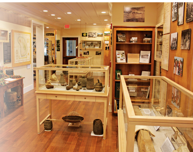
Lānaʻi Culture & Heritage Center

Your encounters with the people of Lānaʻi will be just as memorable. Friendly, welcoming and more than willing to “talk story” about life on Lānaʻi today or during the ranching and plantation eras, local residents represent the living history of the island. Be sure to stop by the Lānaʻi Culture & Heritage Center in Lānaʻi City to learn more about the rich natural history, Hawaiian traditions and heritage of this special place.