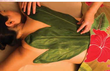
The Spa at Four Seasons Resort Lānaʻi

Lānaʻi offers many wonderful ways to relax. Indulge in a blissful Hawaiian lomilomi or hot pōhaku (stone) massage at The Spa at Four Seasons Resort Lānaʻi. When visiting Lānaʻi City, spoil yourself with a “Dole Stroll.” Browse the one-of-a-kind shops and sample island flavors in the tempting restaurants around Dole Park. Drop into the Mike Carroll Gallery and the Lānaʻi Art Center. And on Saturdays, enjoy shopping for fresh produce at the Farmer’s Market.