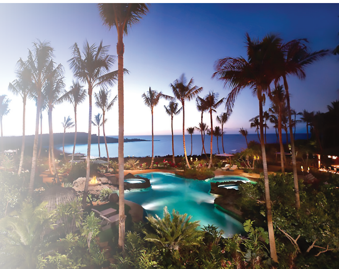
Four Seasons Resort Lānaʻi

Hotel Lānaʻi offers 10 charming rooms and one comfy cottage in a plantation-era structure built by James Dole in 1923. Treat your tastebuds to the Pacific Fusion culinary creations at its in-house restaurant, Lānaʻi City Grille. Much like the island itself, you get a warm, inviting feeling the moment you arrive.