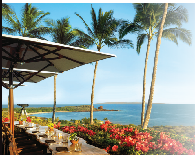
VIEWS at Mānele Golf Course, Four Seasons Resort Lānaʻi

Golfing is pure joy on Lānaʻi. Mānele Golf Course is a Jack Nicklaus Signature Course that plays along the island's rugged coastline and showcases stunning ocean views. With a panorama like this before you, the biggest challenge is keeping your eye on the ball. You can also enjoy the scenery over a delicious meal at VIEWS restaurant adjacent to the Mānele pro shop.