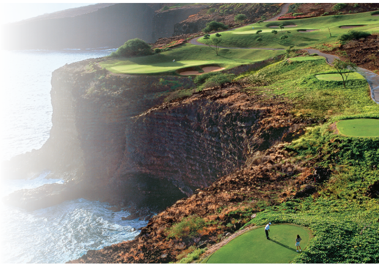
Mānele Golf Course, Four Seasons Resort Lānaʻi

Lānaʻi offers many wonderful ways to relax. Indulge in a blissful Hawaiian lomilomi or hot pōhaku (stone) massage at The Spa at Four Seasons Resort Lānaʻi. When visiting Lānaʻi City, spoil yourself with a “Dole Stroll.” Browse the one-of-a-kind shops and sample island flavors in the tempting restaurants around Dole Park. Drop into the Mike Carroll Gallery and the Lānaʻi Art Center. And on Saturdays, enjoy shopping for fresh produce at the Farmer’s Market.