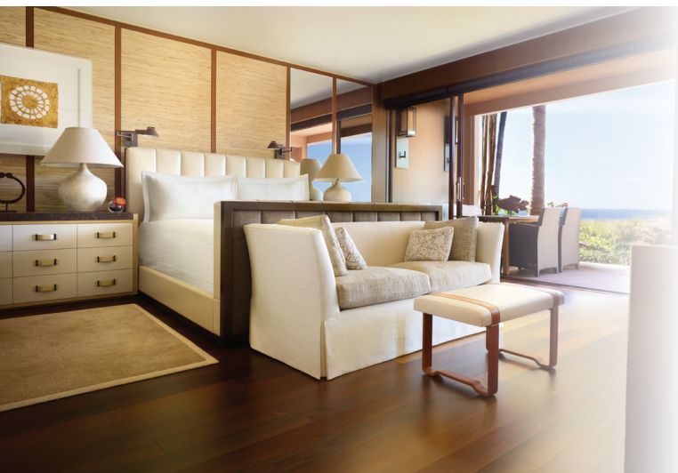
Four Seasons Resort Lānaʻi

Sitting majestically atop a red-lava cliff is Four Seasons Resort Lānaʻi, featuring a view of Hulopoʻe Bay that will steal your breath away, with two inviting pools and easy access to some of the island's best swimming and snorkeling. Each of its 213 rooms comes with a private lanai (balcony) for unwinding from the day's activities. Outstanding local dining including Nobu Lānaʻi and ONE FORTY American Steak, Hawaiian Seafood and superb professional services complete the picture of this exceptional resort.